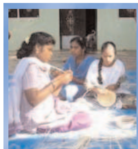
Soroptimist awarded about $40,000 to the Center for Women's Development Research in India for a project that will create and strengthen employment opportunities and provide health education and services for single women in tsunami-affected areas.

Soroptimist's programs and projects create tangible progress for women and girls around the world. Soroptimists are committed to helping women's dreams become a reality.